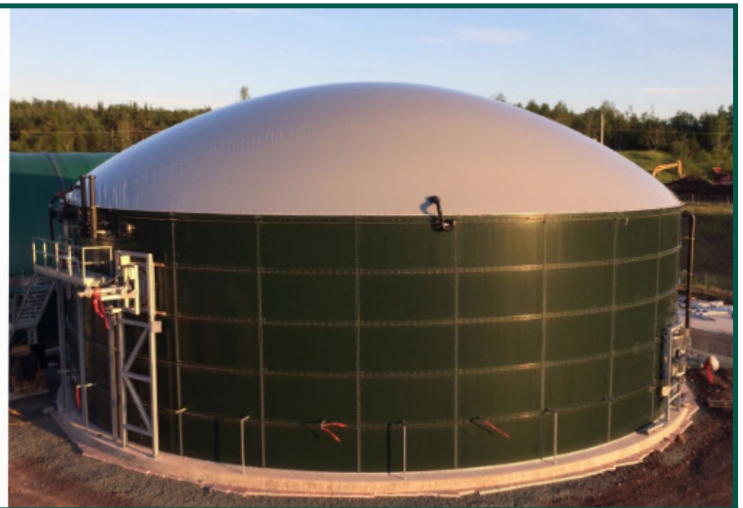
Electrical output: 500 kW | Commissioning: 2018 | Composting Facility