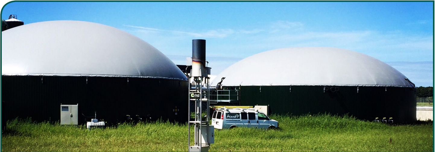
Electrical output: 500 kW | Commissioning: 2012 | Expansion: 2014